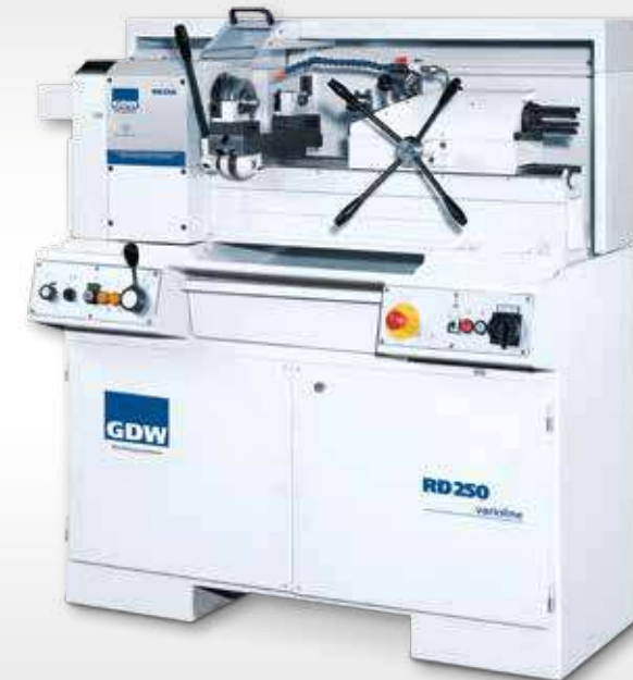
Image including options