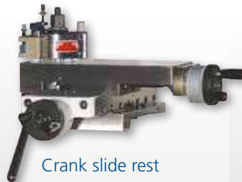
Crank slide rest