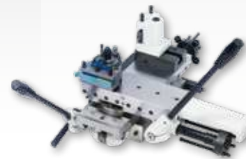
Crosswise lever support